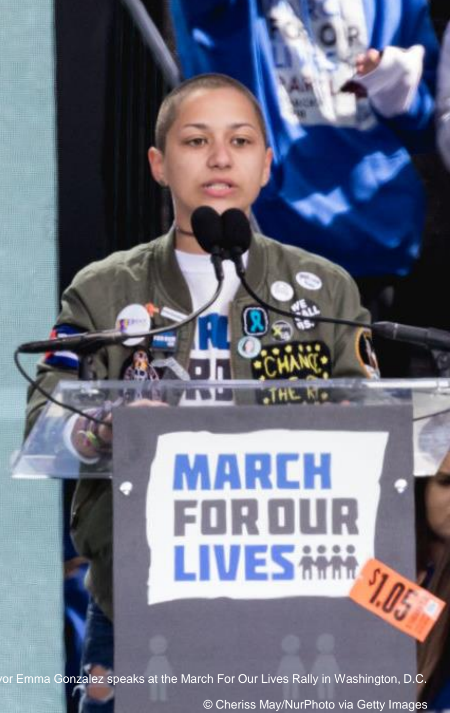
Parkland shooting survivor Emma Gonzalez speaks at the March For Our Lives Rally in Washington, D.C.

Every child has the right to say what they think in all matters affecting them, and to have their views taken seriously.